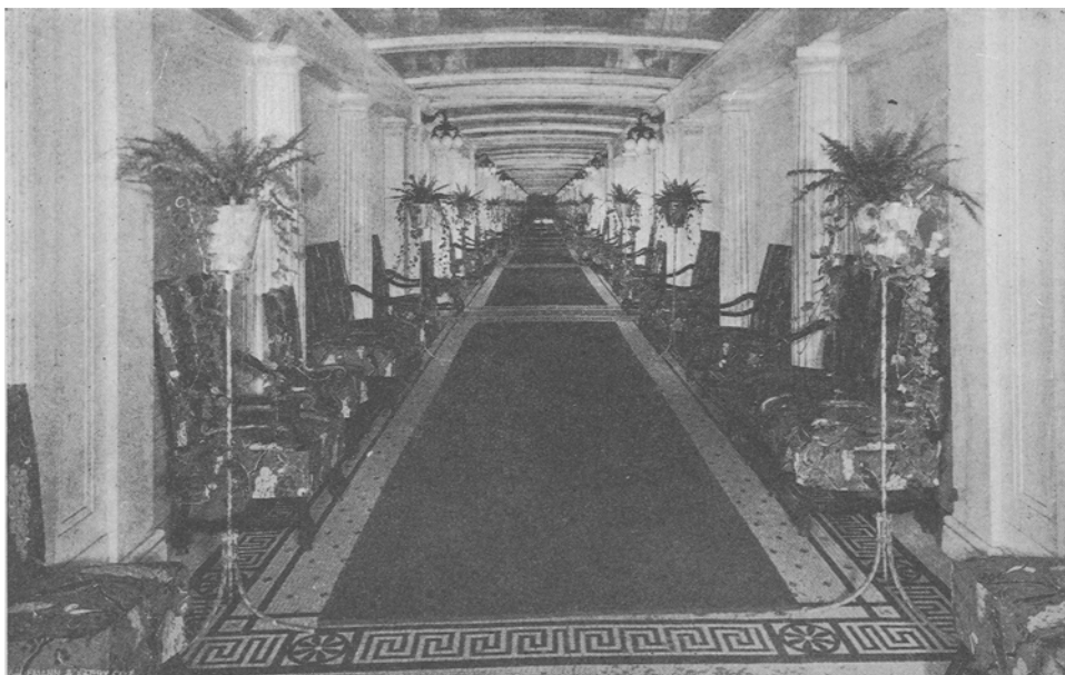
Promenade Lounge, "Peacock Alley," Congress Hotel, Chicago

Record Attendance and Instructive Symposium of Technical Papers Expected at Midwest Gathering in October